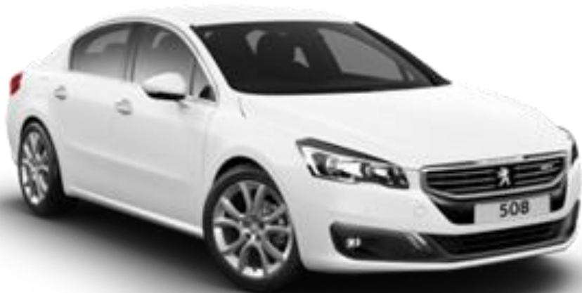
NEW PEUGEOT 508